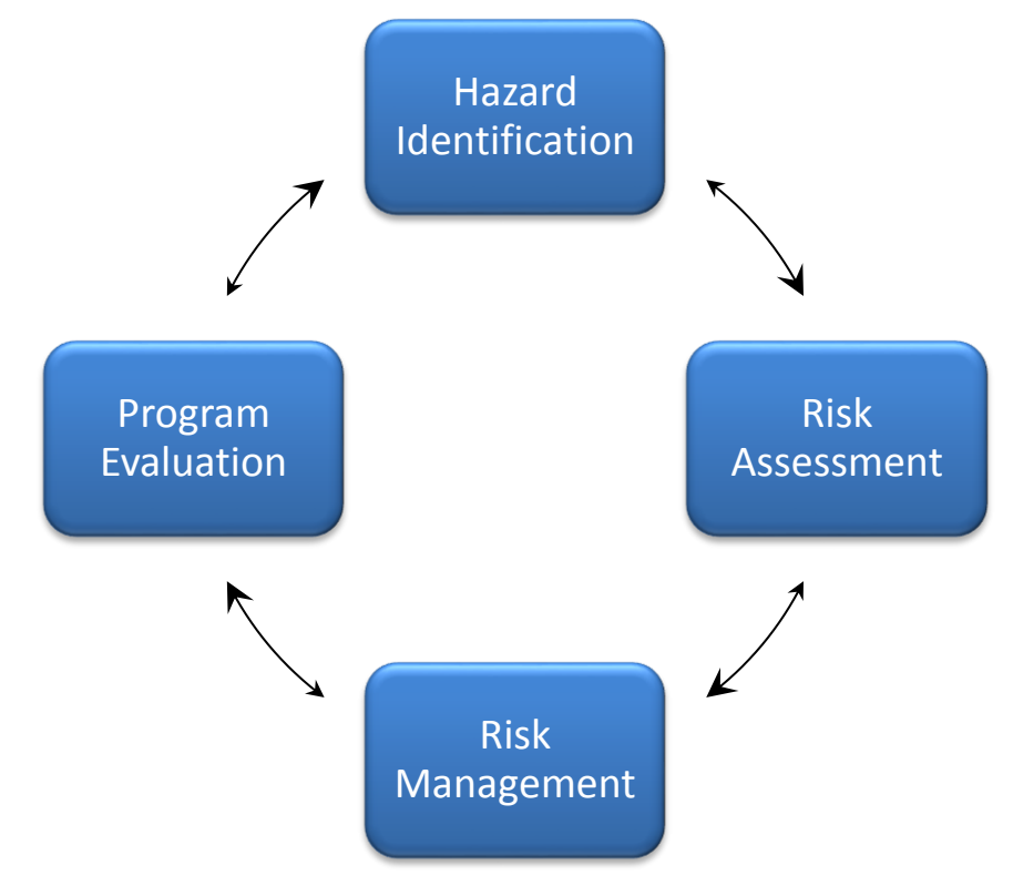
Figure 1: FHP cycle, adapted from Figure B.1 in AJP-3.14.

2. Effective FHP is contingent on a timely and accurate cycle of hazard identification, risk assessment, risk management and program evaluation. This cycle is depicted in Figure 1.